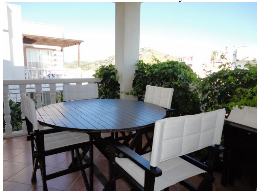
Both apartments have a large balcony with seating for 6 where you can sit outside and have your meals, one with direct sea views, the other with views from the roof terrace.