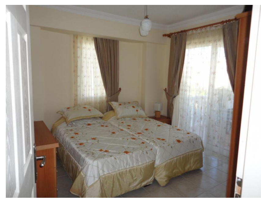
One of the bedrooms opens out onto the large balcony and the second bedroom has a small balcony area

There are 2 bedrooms which can be made up as twin or doubles and we offer sheets and blankets or duvets for our clients use. There are air conditioning units in both bedrooms, as well as the lounge area and fans provided.